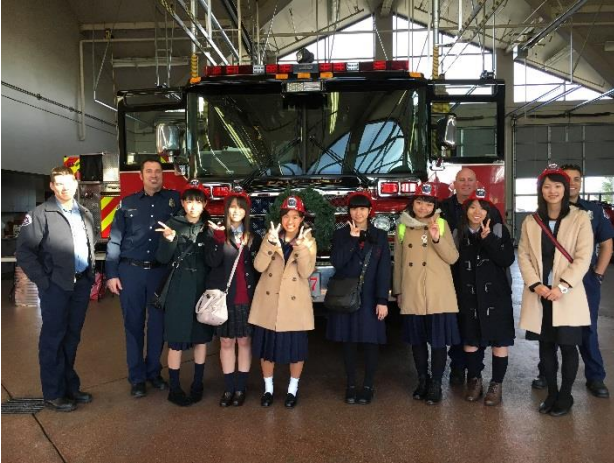
Students enjoying their tour of the main fire station in Fairfield