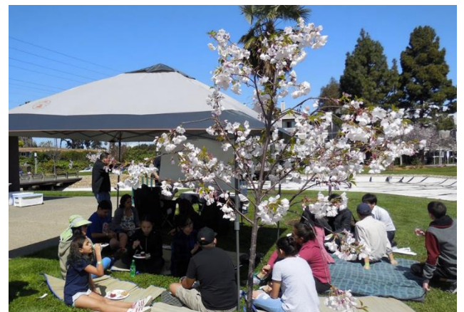
Guests and volunteers share food under the cherry blossoms at Braly Park on March 25

Blue skies after a week of clouds and rain. What a miracle! On Saturday March 25, the Sunnyvale Sister City Association held their 2 nd Annual HANAMI at Braly Park, the site of more than 20 lizuka-donated cherry blossom trees. This year 40 people attended the potluck, which took place under the fully bloomed trees. Though still young, each tree carried many blossoms, and I look forward to seeing how they grow between now and next year's event!