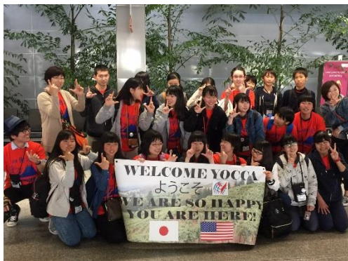
Yotsukaido delegation being welcomed at the airport with a sign

The Livermore/Yotsukaido Sister City Organization hosted their annual incoming visit from the Yotsukaido in mid-March. While here the students and chaperones stayed with host families in Livermore, went to school for three days with their host student, and enjoyed a trip to San Francisco. The chaperones retreated to shopping and wine tasting around Livermore. Everyone had a really good time.